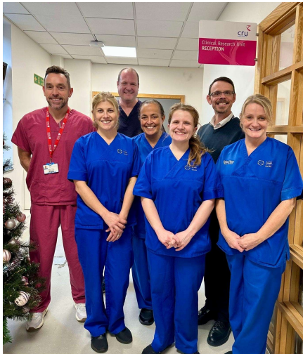
The Swansea team

A huge congratulations to the Swansea team for being our top recruiting site! They have successfully randomised an impressive 20 participants this year.